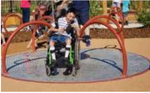
(N) Wheelchair Carousel (Inclusive)