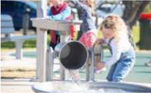
(L) Multi Channel Water Play (Inclusive)