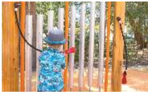
(J) Musical Play (Sensory)