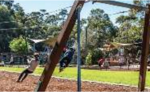
(K) Double Flying Fox (Exploration)