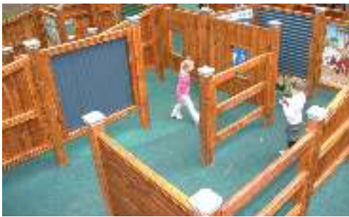
(I) Sensory Maze (Inclusive)