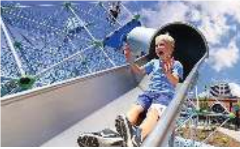
(M) Large Net with Slide (Exploration)