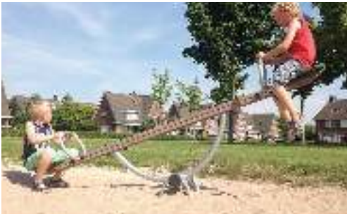
(P) Seesaw (Springer)