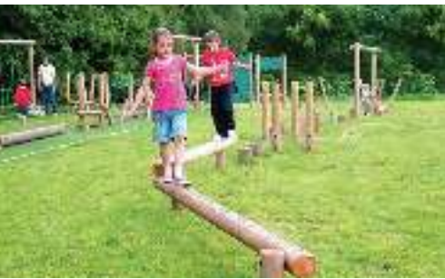
(F) Recycled Timber Balance Beams (Balance)