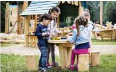
(G) Recycled Timber Meeting Tables (Inclusive)