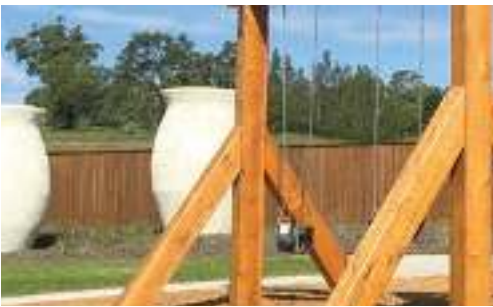
(H) Double Swings (Swings)