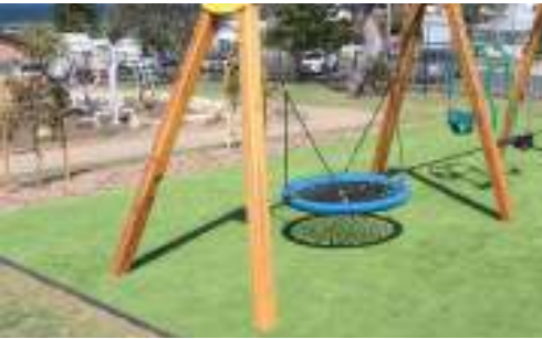
(A) Nest Swing (Swings)