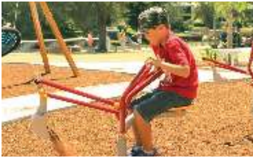
(D) Excavators (Sensory)