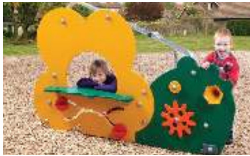
(E) Interactive panels (Inclusive)