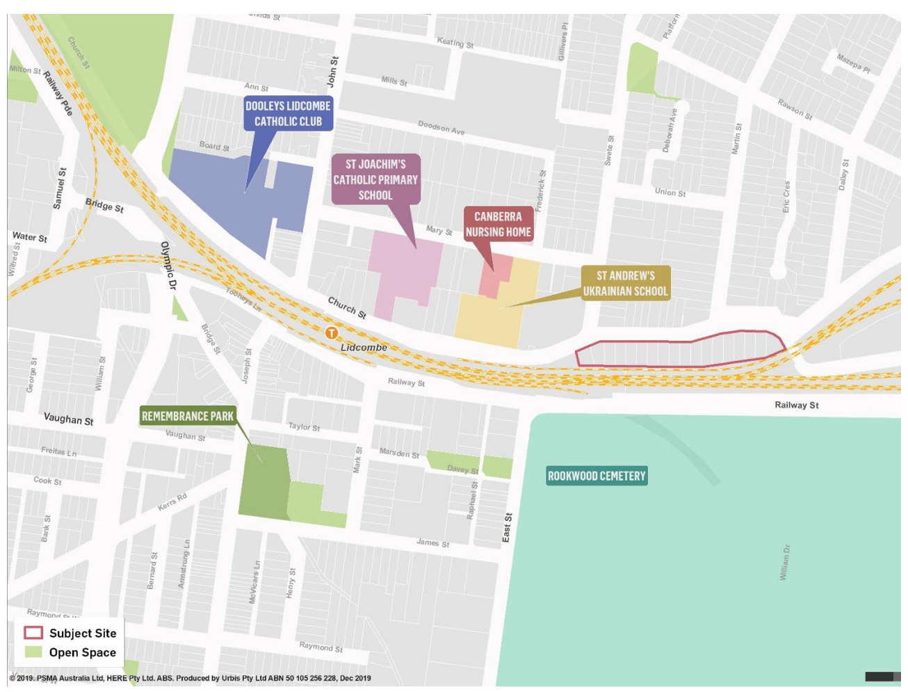
Figure 5 Site context

The mix of single storey and high density dwellings also represents the changing nature of the suburb. Lidcombe is currently transitioning from a low-density railway suburb to a transit-oriented development centre in response to growth. This change has resulted in an increase in residential flat buildings and density within the town centre. It is expected this growth and density will continue if strategic directions to increase building heights and change planning controls within Lidcombe are realised.