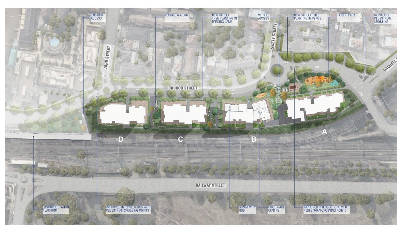
Figure 2 Landscape Plan, ground floor