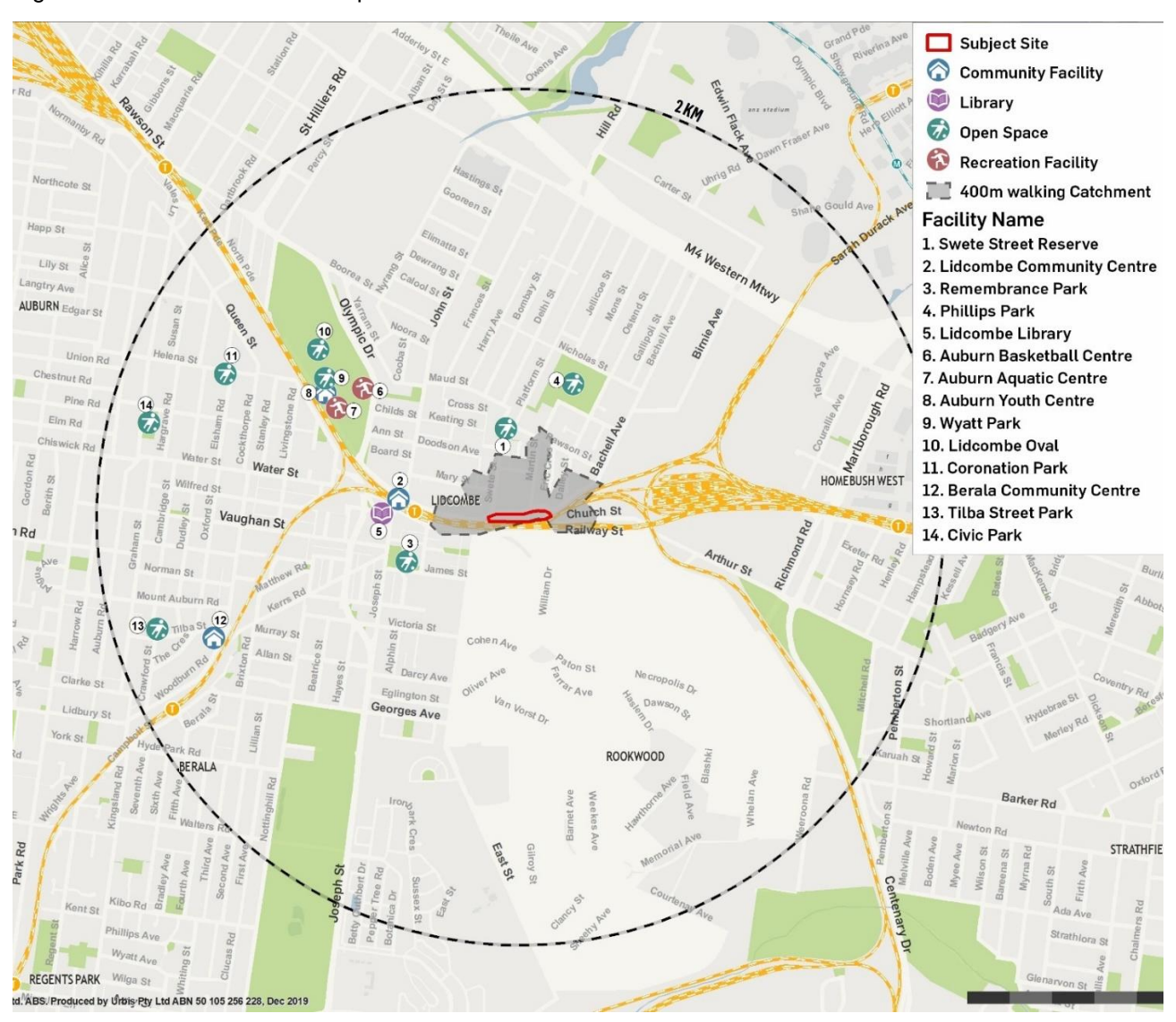
Figure 7 Social infrastructure map