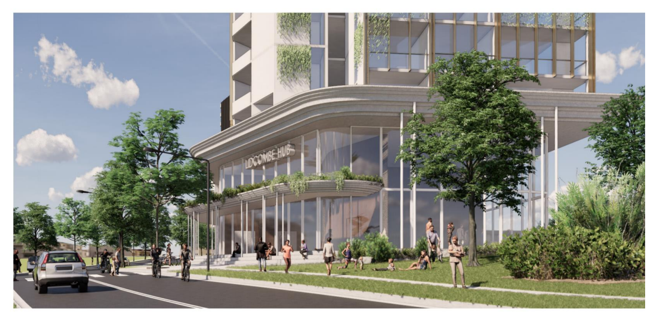
Figure 3 Proposed community hub