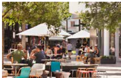
A 'village green type space' is located midway along the site as a pivotal civic space, with focal seasonal tree planting areas, and interpretive features.