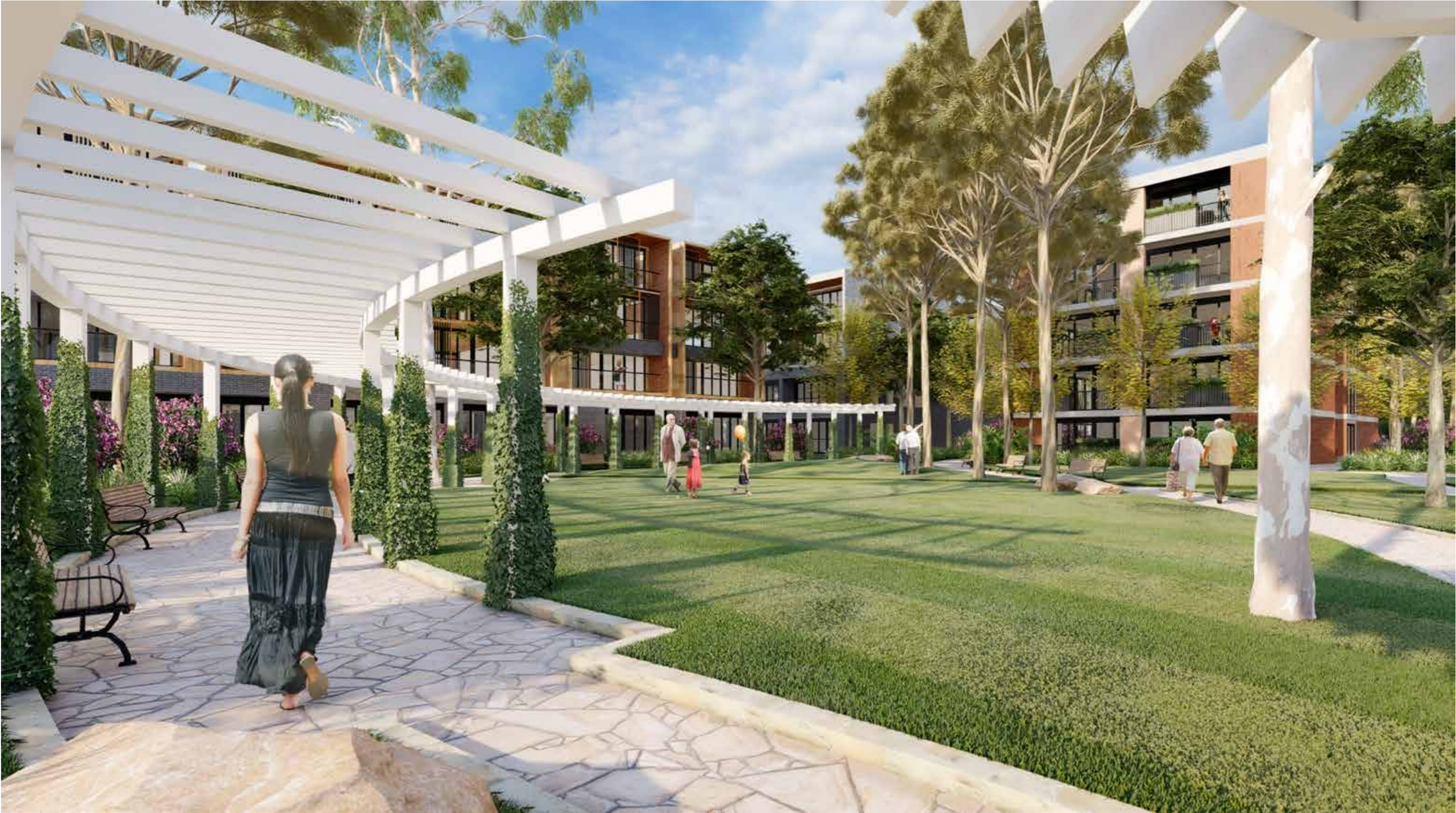
Indicative Landscape Perspective

Open space has been located to retain significant trees identified with the project Arborist, and to create an inviting series of connective spaces. Connective and inviting parks, civic links and walkways create north south through site links, and east-west connections as shown on the plan.