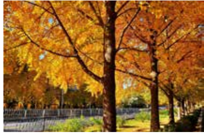
Avenue tree planting flanks the site entry road from the existing roundabout, with a separate pedestrian walkway with feature planting.