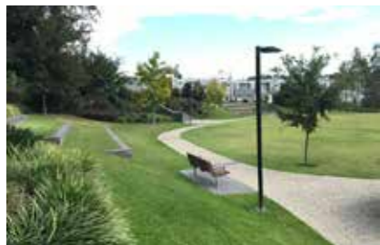
A focal park area has a signature pergolas arc and walkway, defining a broad lawn, with large existing trees retained and provided a generous visual setting.