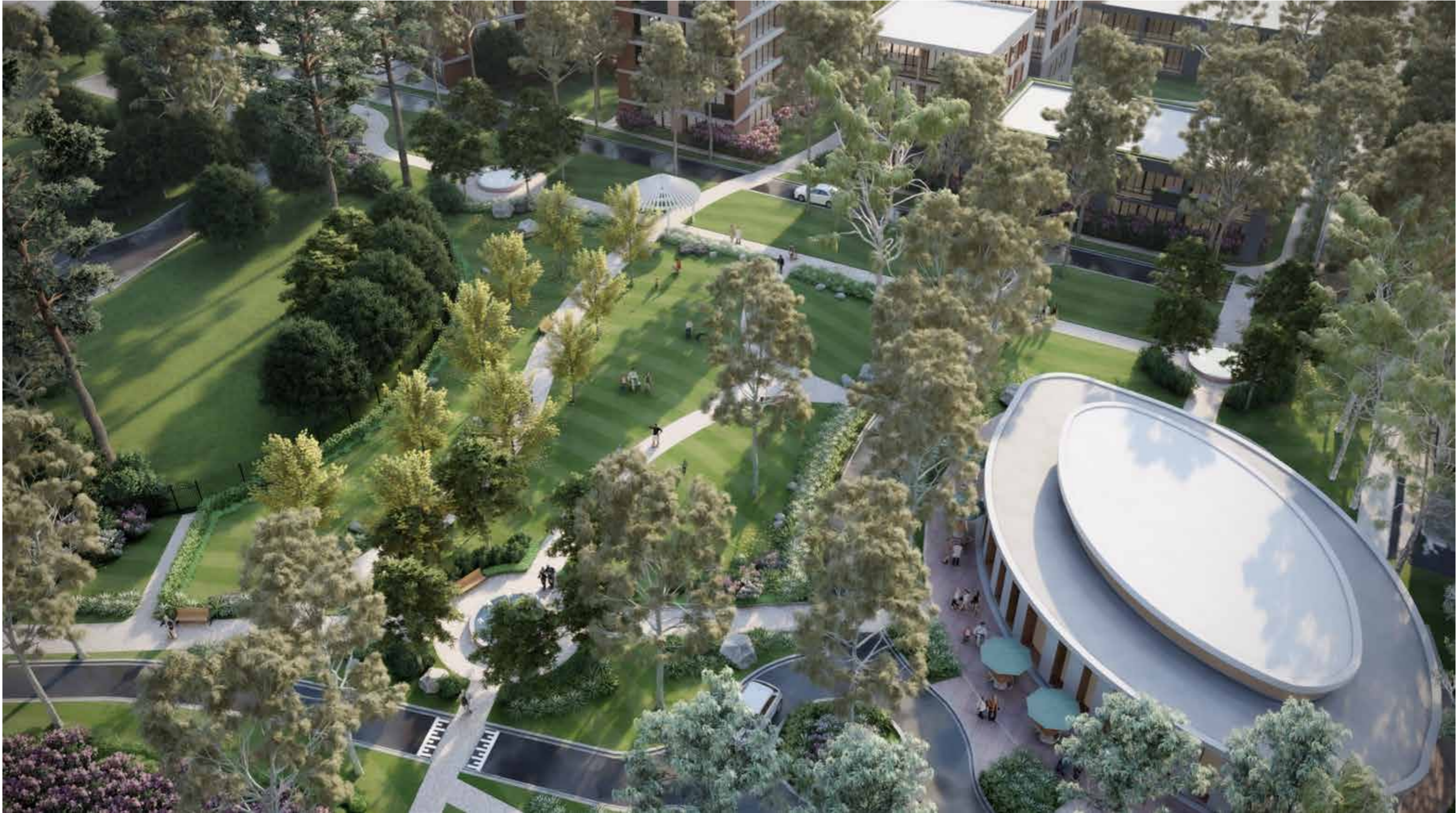
Indicative Landscape Perspective

Within the central precinct a large park is proposed for the benefit of all CGV residents and the public. The CGV community building is located opposite the Sherwood Scrubs heritage building and its generous lawn - together creating a substantial landscape open space.