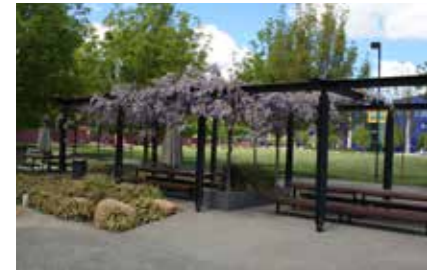
A large open lawn with retained canopy trees has pergola covered walkways, & avenue tree planting to walkways, and series of seating areas.