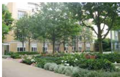
A strong residential character is created along the E/W walkways, with seating nodes, community gardens, and destination pergolas at regular intervals