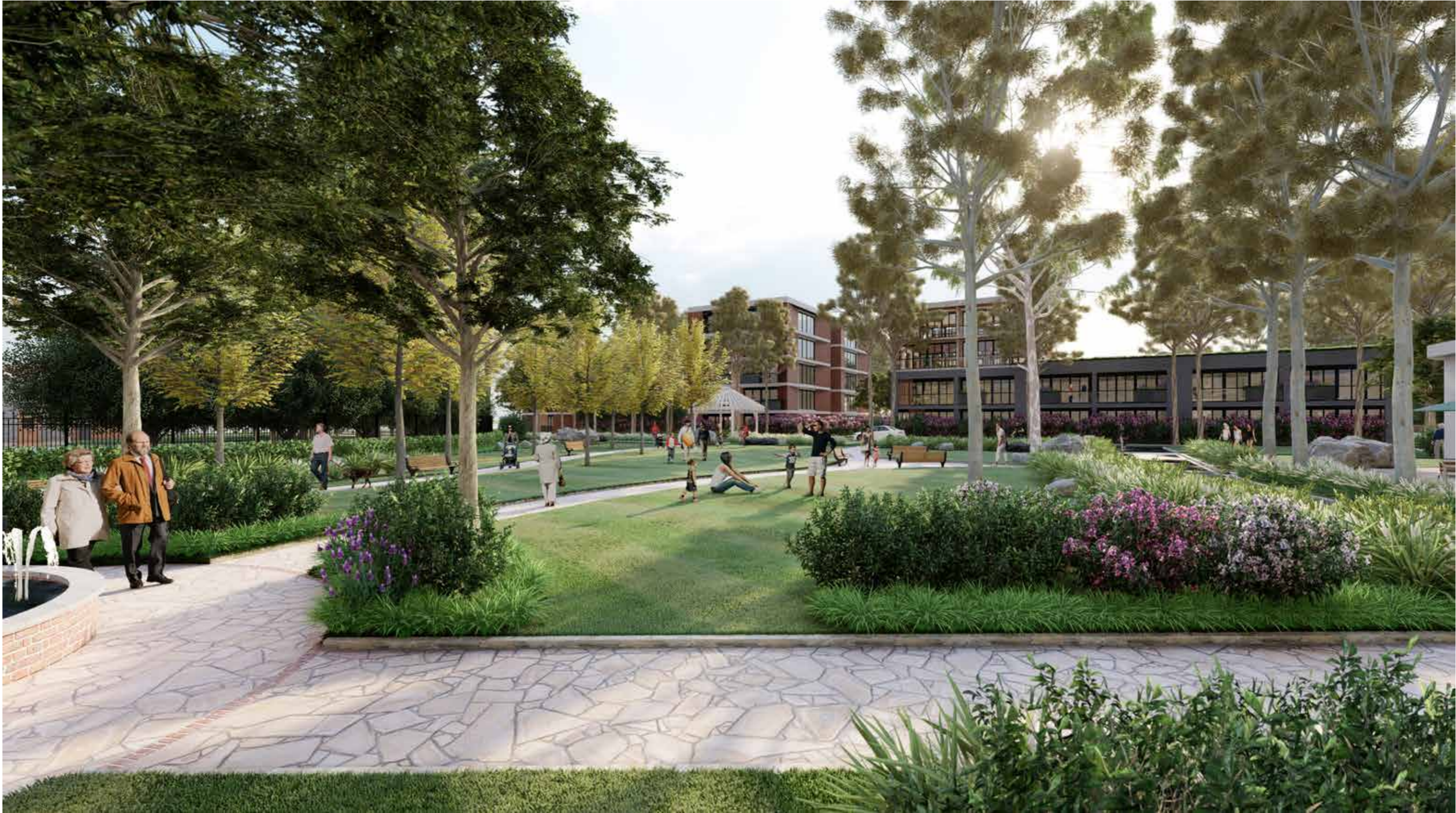
Indicative Landscape Perspective

The connective walkways and series of open spaces invite the community into the site, celebrating social engagement that can contribute significantly to the amenity and integration of the local area. Existing trees will provide an immediate mature landscape identity to the open space.