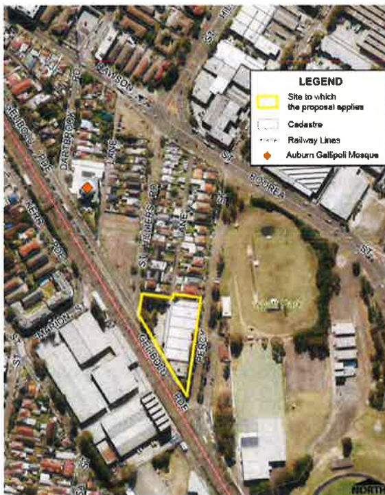
Figure 1- Subject site

The site has been used for various industrial purposes since the 1930s. The existing building on the site, currently used by the Master Plumbers and Contractors Association of NSW, is proposed to be adapted for use by the school, including a small addition to roof (cafeteria and toilets).