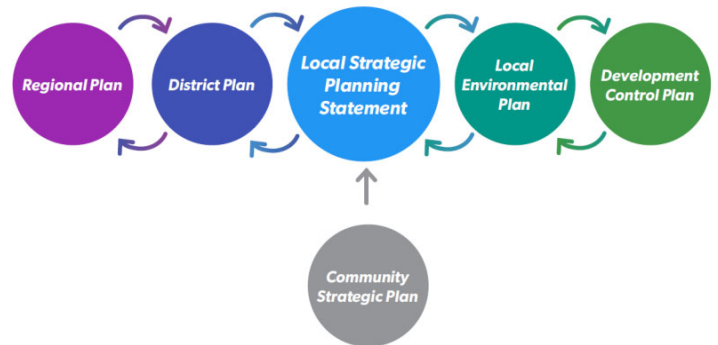
Feedback cycle from local to regional planning