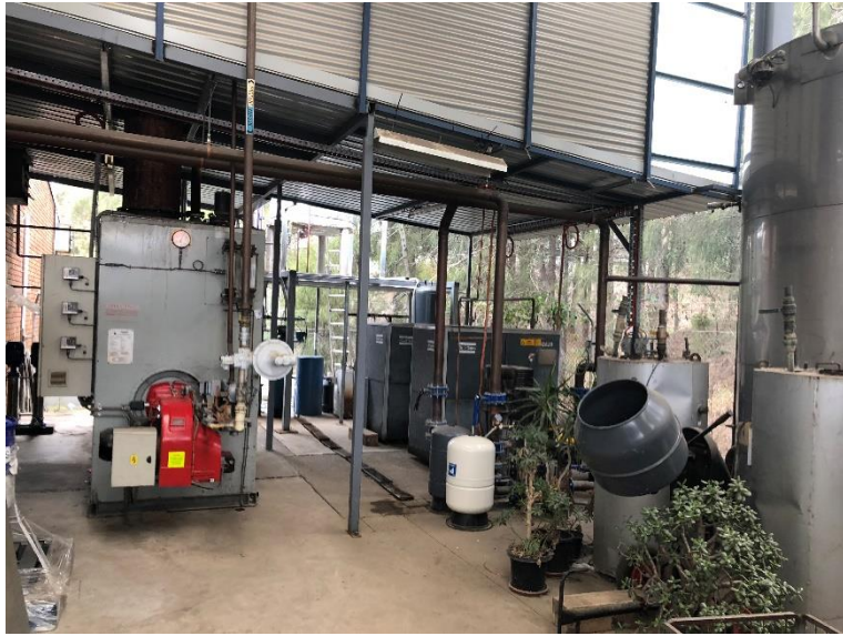
Exterior of laundromat building – boiler area.