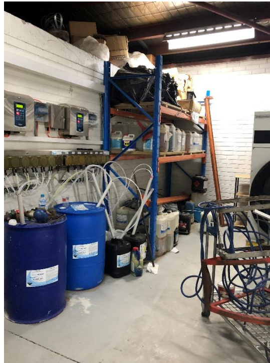
Chemical store within laundromat business.