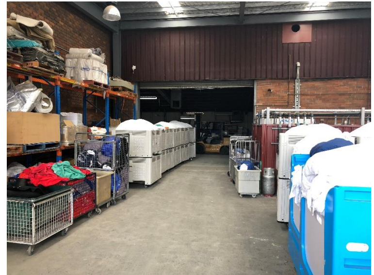
Exterior of laundromat building – chemical dispensing unit and storage.