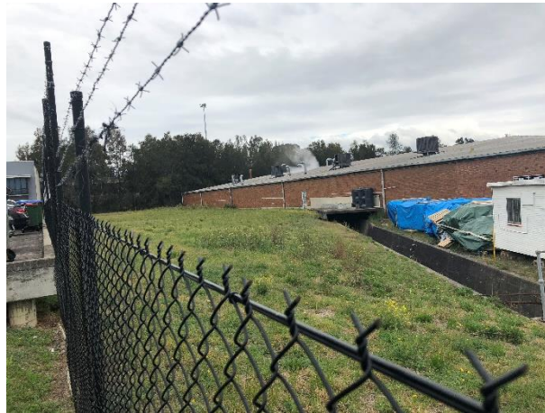
Yard 2 vacant land and temporary storage of construction materials.