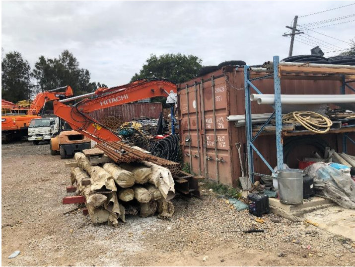
Yard 1A stored items and ground cover.