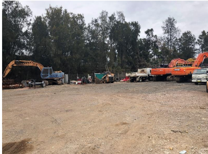
Yard 1B stored items and ground cover.