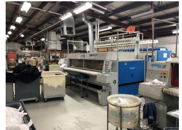
Interior of laundromat business.