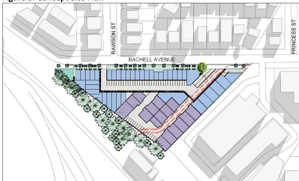
Figure 3: Concept Site Plan