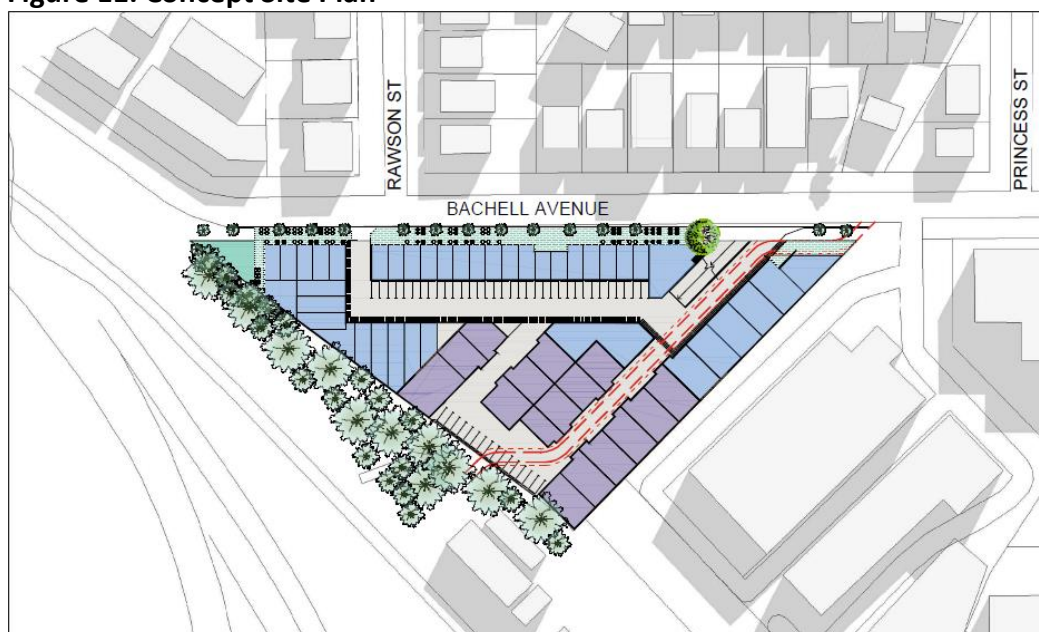
Figure E1: Concept Site Plan

Source: Michael Raad Architects, Proposed Development Concept Design, 2 Bachell Avenue, Lidcombe, 14 August 2018