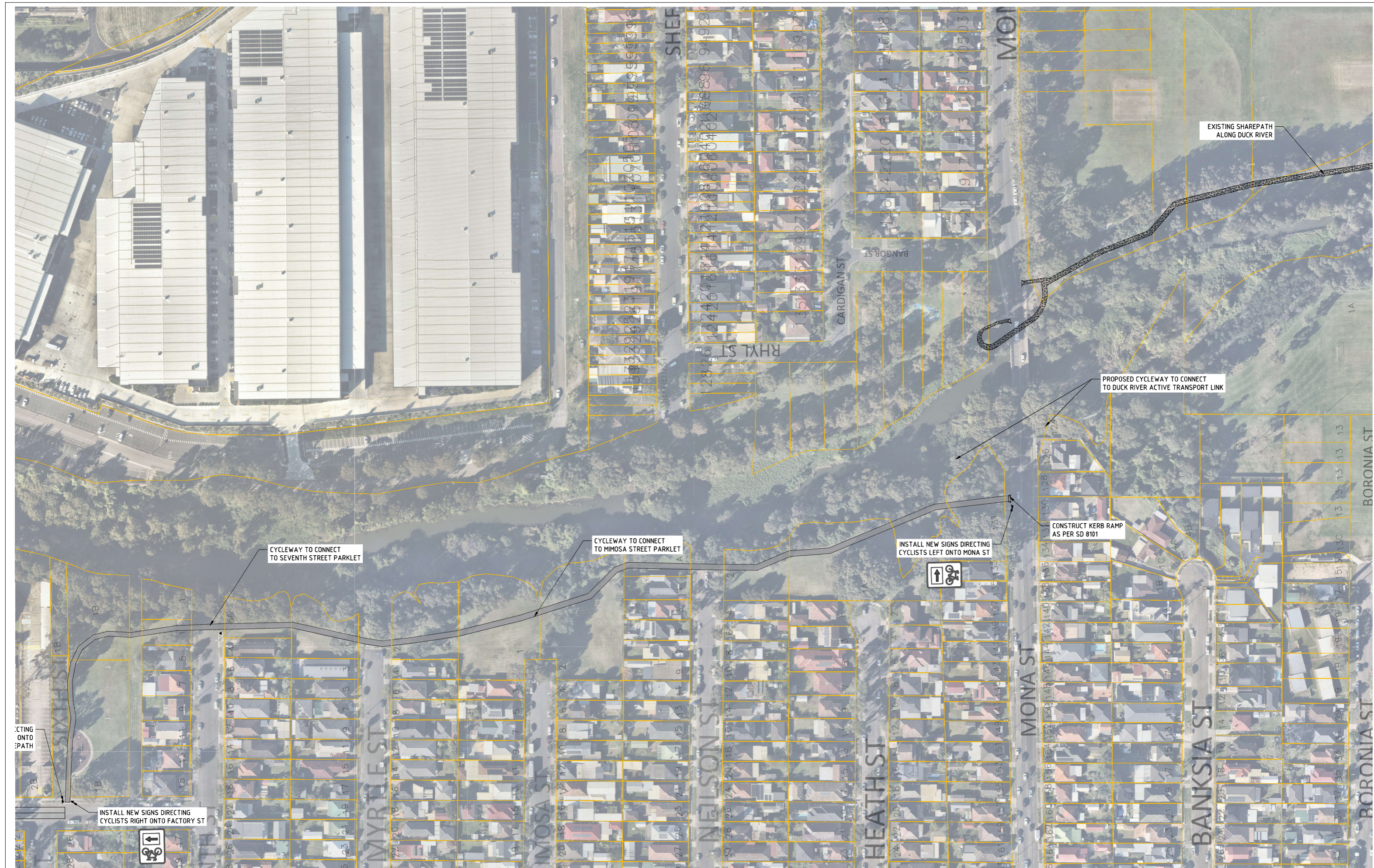
PLAN SCALE 1:1000 AT A1